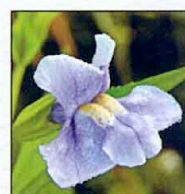
Lavender musk